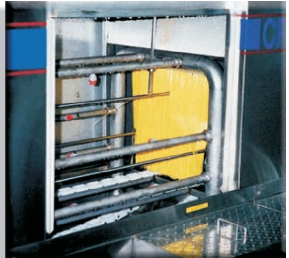
Showing a nylon curtain dividing washer and rinse section. (This helps to prevent water carry-over)