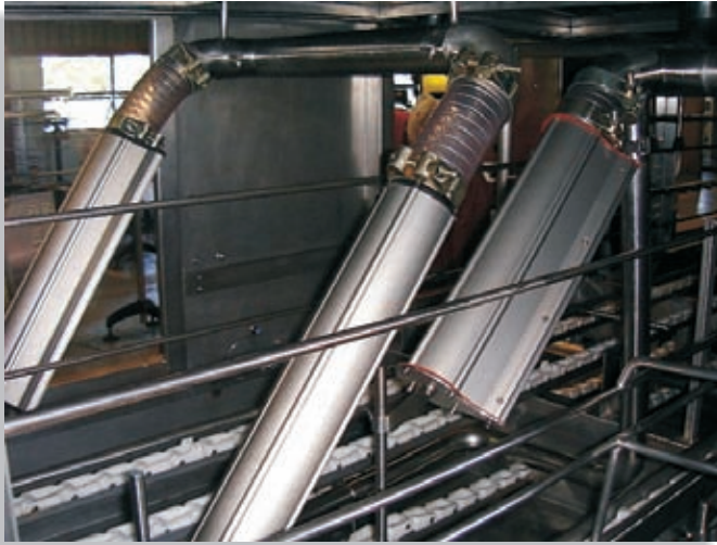
A Sonic Air Knife system for effective removal of excess water